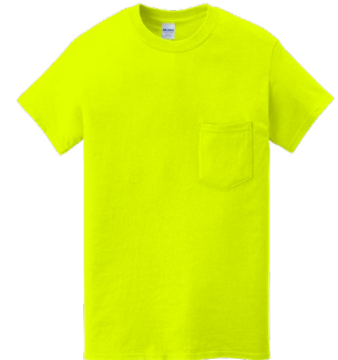
GILDAN® Heavy Cotton™ 100% Cotton Pocket T-Shirt 5300 | Adult Sizes: S-3XL