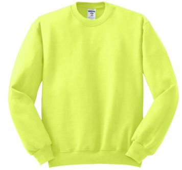
JERZEES® NuBlend® Crewneck Sweatshirt 562M | Adult Sizes: S-4XL