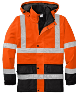
CORNERSTONE® ANSI 107 Class 3 Waterproof Parka CSJ24 | Adult Sizes: S-4XL