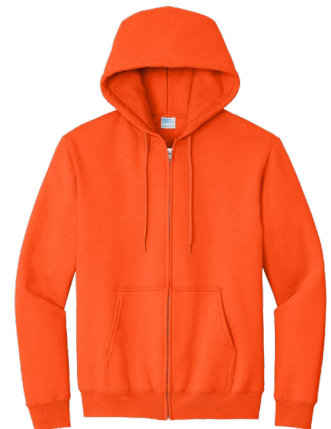
PORT & COMPANY® Essential Fleece Full-Zip Hooded Sweatshirts PC90ZH | PC90ZHT | Adult Sizes: S-4XL | Tall Sizes: LT-4XLT