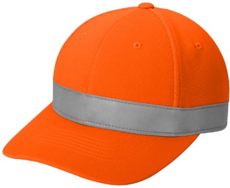
CORNERSTONE® ANSI 107 Safety Cap CS802