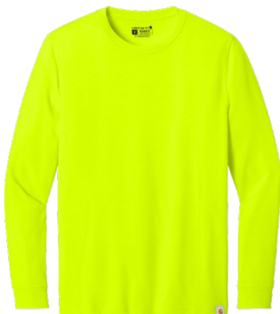
CARHARTT FORCE® Long Sleeve T-Shirt CT106921 | Adult Sizes: S-4XL