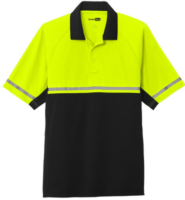
CORNERSTONE® Select Lightweight Snag-Proof Enhanced Visibility Polo CS423 | Adult Sizes: XS-4XL