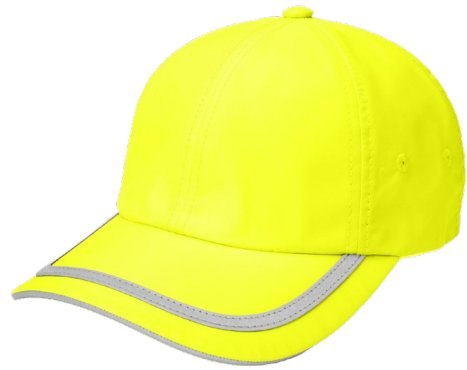
PORT AUTHORITY® Enhanced Visibility Cap C836