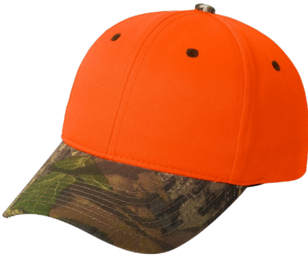
PORT AUTHORITY® Enhanced Visibility Cap with Camo Brim C804