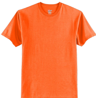
HANES® Authentic 100% Cotton T-Shirt 5250 | Adult Sizes: S-5XL