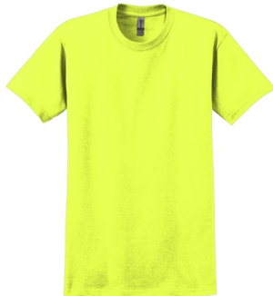
GILDAN® Ultra Cotton® 100% US Cotton T-Shirts 2000 | 2000T | 2000B | Adult Sizes: S-5XL | Tall Sizes: LT-3XLT | Youth Sizes: XS-XL