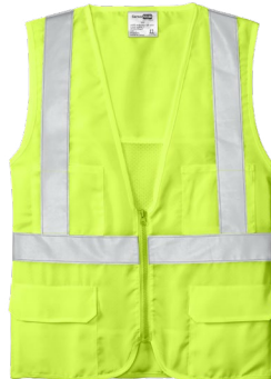
CORNERSTONE® ANSI 107 Class 2 Mesh Back Safety Vest CSV405 | Adult Sizes: S-4XL