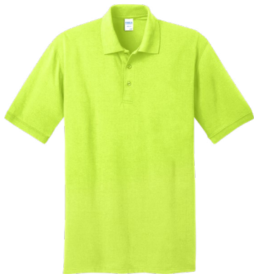
PORT & COMPANY® Core Blend Jersey Knit Polos KP55 | KP55T | Adult Sizes: XS-6XL | Tall Sizes: LT-4XLT