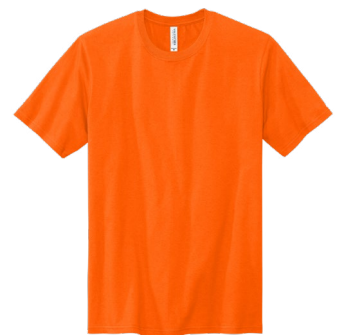
VOLUNTEER KNITWEAR™ All-American Tee VL100 | Adult Sizes: S-4XL