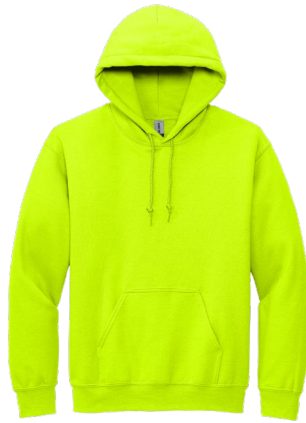
GILDAN® DryBlend® Pullover Hooded Sweatshirt 12500 | Adult Sizes: S-3XL