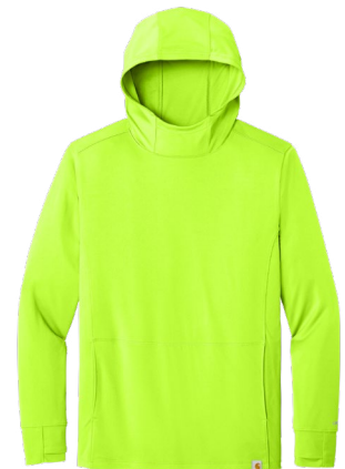
CARHARTT FORCE® Sun Defender™ Long Sleeve Hooded T-Shirt CT106923 | Adult Sizes: S-4XL