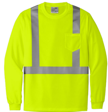
CORNERSTONE® ANSI 107 Class 2 Mesh Long Sleeve Tee CS201 | Adult Sizes: S-5XL