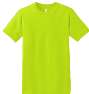
HANES® Essential-T 100% Cotton T-Shirt 5280 | Adult Sizes: S-3XL