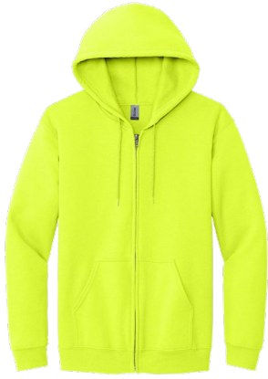
GILDAN® Heavy Blend™ Full-Zip Hooded Sweatshirt 18600 | Adult Sizes: S-5XL