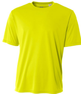
A4 Sprint Performance Tee A4N3402 | Adult Sizes: XS-4XL