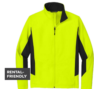
PORT AUTHORITY® Core Colorblock Soft Shell Jacket J318 | Adult Sizes: XS-4XL