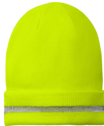
CORNERSTONE® Enhanced Visibility Beanie with Reflective Stripe CS800