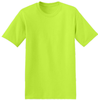
HANES® EcoSmart® 50/50 Cotton/Poly T-Shirt 5170 | Adult Sizes: S-4XL