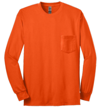
GILDAN® Ultra Cotton® 100% US Cotton Long Sleeve T-Shirt with Pocket 2410 | Adult Sizes: S-4XL