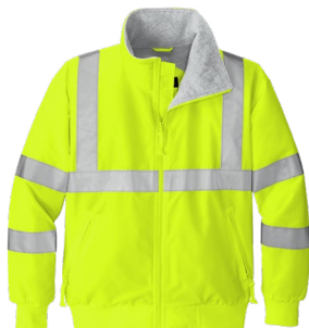
PORT AUTHORITY® Enhanced Visibility Challenger™ Jacket with Reflective Taping SRJ754 | Adult Sizes: XS-6XL