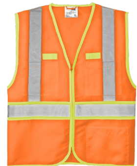
CORNERSTONE® ANSI 107 Class 2 Dual-Color Safety Vest CSV407 | Adult Sizes: S-4XL