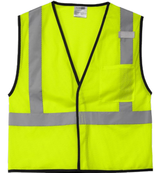
CORNERSTONE® ANSI 107 Class 2 Economy Mesh One-Pocket Vest CSV100 | Adult Sizes: S/M, L/XL, 2XL/3XL, 4XL/5XL