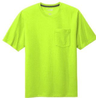
CORNERSTONE® Workwear Pocket Tee CS430 | Adult Sizes: S-4XL