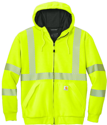
CARHARTT® ANSI 107 Class 3 Lined Full-Zip Sweatshirt CT104988 | Adult Sizes: S-4XL