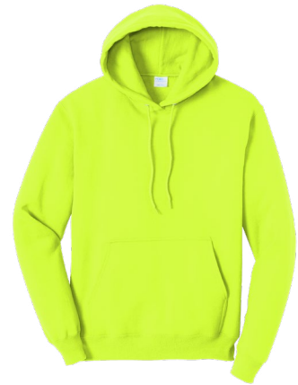
PORT & COMPANY® Core Fleece Pullover Hooded Sweatshirt PC78H | Adult Sizes: S-4XL