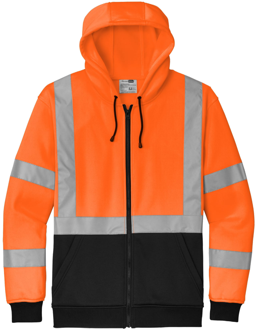
CORNERSTONE® ANSI 107 Class 3 Heavy-Duty Fleece Full-Zip Hoodie CSF300 | Adult Sizes: M-5XL