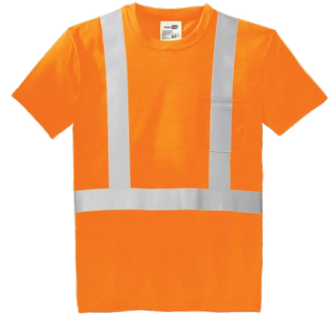
CORNERSTONE® ANSI 107 Class 2 Safety T-Shirt CS401 | Adult Sizes: XS-4XL