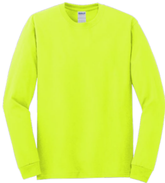
GILDAN® Heavy Cotton™ 100% Cotton Long Sleeve T-Shirt 5400 | Adult Sizes: S-3XL