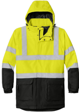
PORT AUTHORITY® ANSI 107 Class 3 Safety Heavyweight Parka J799S | Adult Sizes: XS-4XL