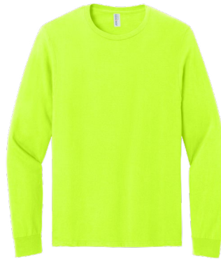
JERZEES CLASSICS™ Unisex Cotton Long Sleeve T-Shirt 363L | Adult Sizes: S-3XL