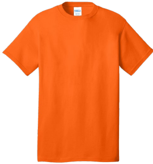
PORT & COMPANY® Core Cotton Tee PC54 | Adult Sizes: S-6XL