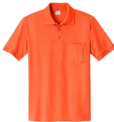
PORT & COMPANY® Core Blend Jersey Knit Pocket Polo KP55P | Adult Sizes: S-6XL