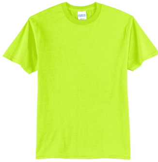
PORT & COMPANY® Core Blend Tees PC55 | PC55T | PC55Y | Adult Sizes: S-6XL | Tall Sizes: LT-4XLT | Youth Sizes: XS-XL