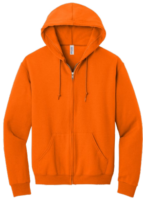
JERZEES® NuBlend® Full-Zip Hooded Sweatshirt 993M | Adult Sizes: S-3XL