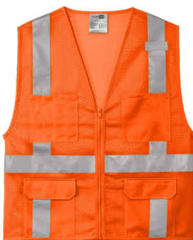
CORNERSTONE® ANSI 107 Class 2 Mesh Six-Pocket Zippered Vest CSV104 | Adult Sizes: S/M, L/XL, 2XL/3XL, 4XL/5XL