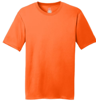
HANES® Cool Dri® Performance T-Shirt 4820 | Adult Sizes: XS-3XL