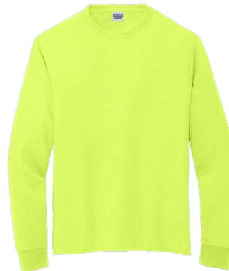
JERZEES® Dri-Power® 100% Polyester Long Sleeve T-Shirt 21LS | Adult Sizes: S-3XL