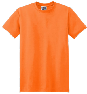
JERZEES® Dri-Power® 100% Polyester T-Shirt 21M | Adult Sizes: S-3XL