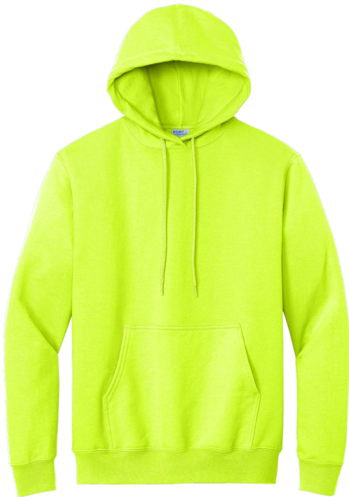
PORT & COMPANY® Essential Fleece Pullover Hooded Sweatshirts PC90H | PC90HT | Adult Sizes: S-4XL | Tall Sizes: LT-4XLT