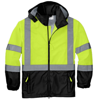
CORNERSTONE® ANSI 107 Class 3 Safety Windbreaker CSJ25 | Adult Sizes: S-4XL