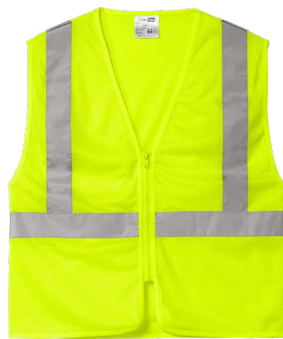
CORNERSTONE® ANSI 107 Class 2 Economy Mesh Zippered Vest CSV101 | Adult Sizes: S/M, L/XL, 2XL/3XL, 4XL/5XL