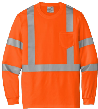
CORNERSTONE® ANSI 107 Class 3 Mesh Long Sleeve Tee CS203 | Adult Sizes: S-5XL