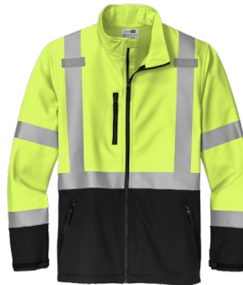
CORNERSTONE® ANSI 107 Class 3 Soft Shell Jacket CSJ503 | Adult Sizes: S-5XL