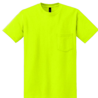
GILDAN® DryBlend® 50 Cotton/50 Poly Pocket T-Shirt 8300 | Adult Sizes: S-3XL