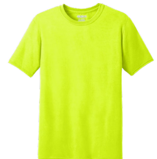
GILDAN® Performance® T-Shirt 42000 | Adult Sizes: S-3XL