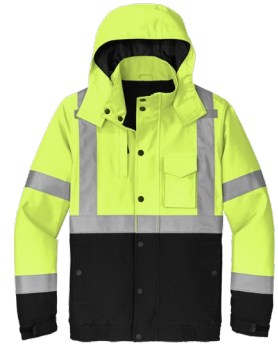
CORNERSTONE® ANSI 107 Class 3 Waterproof Insulated Ripstop Bomber Jacket CSJ501 | Adult Sizes: S-5XL