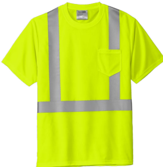
CORNERSTONE® ANSI 107 Class 2 Mesh Tee CS200 | Adult Sizes: S-5XL