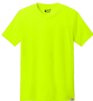
CARHARTT FORCE® Sun Defender™ Short Sleeve T-Shirt CT106868 | Adult Sizes: S-4XL