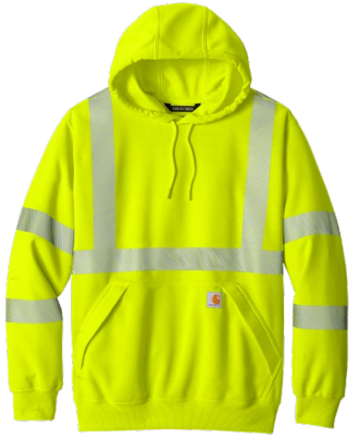
CARHARTT® ANSI 107 Class 3 Hooded Sweatshirt CT104987 | Adult Sizes: S-4XL