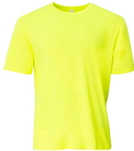
A4 Softek Short Sleeve Tee A4N3013 | Adult Sizes: XS-4XL