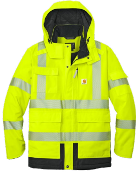
CARHARTT® ANSI 107 Class 3 Waterproof Heavyweight Insulated Jacket CT106694 | Adult Sizes: S-4XL