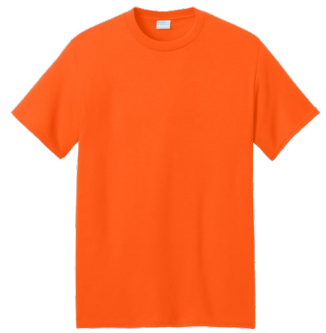
PORT & COMPANY® Core Blend Recycled Tee PC01 | Adult Sizes: S-4XL