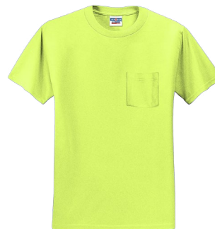
JERZEES® Dri-Power® 50/50 Cotton/Poly Pocket T-Shirt 29MP | Adult Sizes: S-3XL