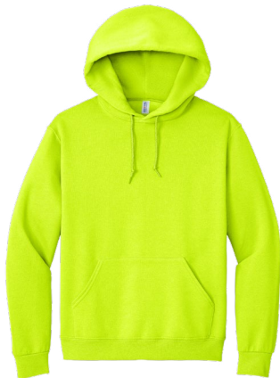
JERZEES® Super Sweats® NuBlend® Pullover Hooded Sweatshirt 4997M | Adult Sizes: S-3XL