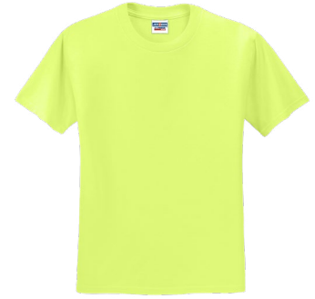
JERZEES® Dri-Power® 50/50 Cotton/ Poly T-Shirts 29M | 29B | Adult Sizes: S-5XL | Youth Sizes: XS-XL