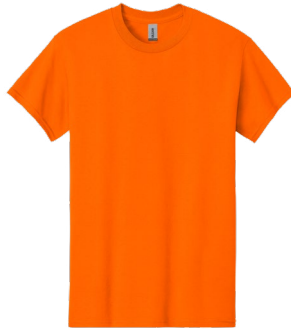
GILDAN® Heavy Cotton™ 100% Cotton T-Shirts 5000 | 5000B | Adult Sizes: S-3XL | Youth Sizes: XS-5XL