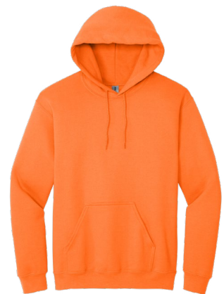
GILDAN® Heavy Blend™ Hooded Sweatshirt 18500 | Adult Sizes: S-5XL