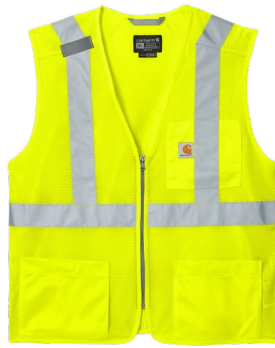
CARHARTT® ANSI Class 2 Mesh Zip-Front Vest CT106171 | Adult Sizes: XS/S, M/L, XL/2XL, 3XL/4XL