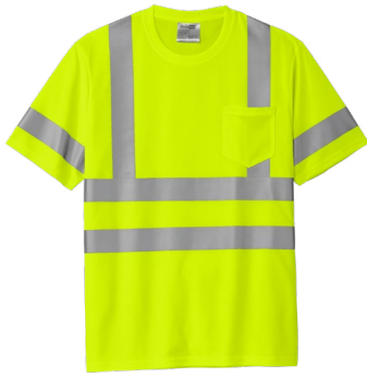
CORNERSTONE® ANSI 107 Class 3 Mesh Tee CS202 | Adult Sizes: M-5XL