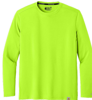
CARHARTT FORCE® Sun Defender™ Long Sleeve T-Shirt CT106972 | Adult Sizes: S-4XL