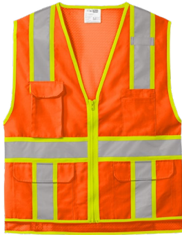
CORNERSTONE® ANSI 107 Class 2 Surveyor Zippered Two-Tone Vest CSV105 | Adult Sizes: S/M, L/XL, 2XL/3XL, 4XL/5XL