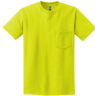
GILDAN® Ultra Cotton® 100% US Cotton T-Shirt with Pocket 2300 | Adult Sizes: S-5XL