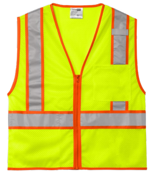
CORNERSTONE® ANSI 107 Class 2 Mesh Zippered Two-Tone Vest CSV103 | Adult Sizes: S/M, L/XL, 2XL/3XL, 4XL/5XL