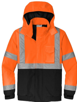
CORNERSTONE® ANSI 107 Class 3 Economy Waterproof Insulated Bomber Jacket CSJ500 | Adult Sizes: S-5XL