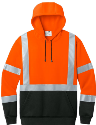
CORNERSTONE® ANSI 107 Class 3 Heavy-Duty Fleece Pullover Hoodie CSF301 | Adult Sizes: M-5XL