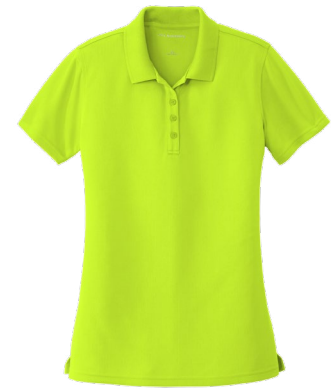
PORT AUTHORITY® Women's Dry Zone® UV Micro-Mesh Polo LK110 | Adult Sizes: XS-4XL