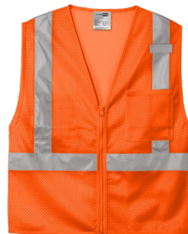
CORNERSTONE® ANSI 107 Class 2 Mesh Zippered Vest CSV102 | Adult Sizes: S/M, L/XL, 2XL/3XL, 4XL/5XL