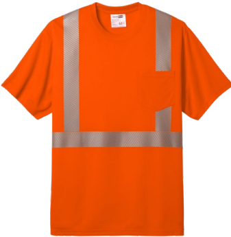
CORNERSTONE® ANSI 107 Class 2 Segmented Tape Tee CS204 | Adult Sizes: S-5XL