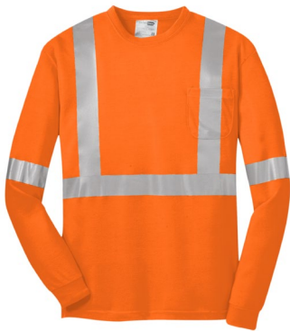
CORNERSTONE® ANSI 107 Class 2 Long Sleeve Safety T-Shirt CS401LS | Adult Sizes: XS-4XL