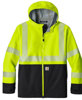
CARHARTT® ANSI 107 Class 3 Storm Defender® Jacket CT106693 | Adult Sizes: S-4XL