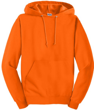
JERZEES® NuBlend® Pullover Hooded Sweatshirt 996M | Adult Sizes: S-4XL