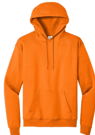
HANES® EcoSmart® Pullover Hooded Sweatshirt P170 | Adult Sizes: S-5XL