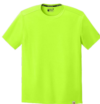
CARHARTT® Short Sleeve T-Shirt CT106020 | Adult Sizes: S-4XL