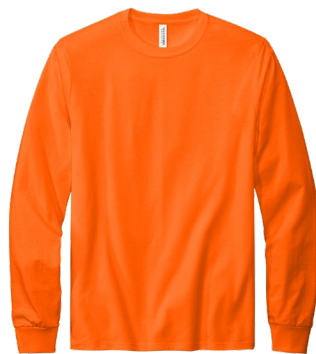
VOLUNTEER KNITWEAR™ All-American Long Sleeve Tee VL100LS | Adult Sizes: S-4XL