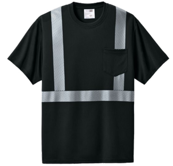
CORNERSTONE® Enhanced Visibility Segmented Tape Tee CS206 | Adult Sizes: S-5XL