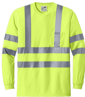
CORNERSTONE® ANSI 107 Class 3 Long Sleeve Snag-Resistant Reflective T-Shirt CS409 | Adult Sizes: XS-4XL