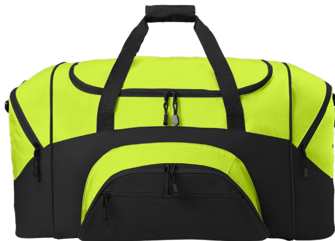
PORT AUTHORITY® Standard Colorblock Sports Duffel BG99