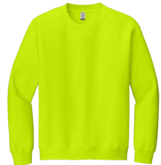
GILDAN® Heavy Blend™ Crewneck Sweatshirt 18000 | Adult Sizes: S-5XL