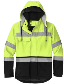
CORNERSTONE® ANSI 107 Class 3 Waterproof Ripstop 3-in-1 Parka CSJ502 | Adult Sizes: S-5XL