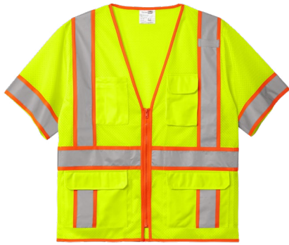
CORNERSTONE® ANSI 107 Class 3 Surveyor Mesh Zippered Two-Tone Short Sleeve Vest CSV106 | Adult Sizes: M-5XL