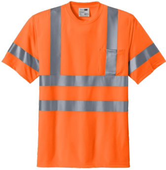
CORNERSTONE® ANSI 107 Class 3 Short Sleeve Snag-Resistant Reflective T-Shirt CS408 | Adult Sizes: XS-4XL