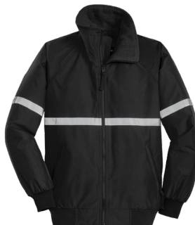
PORT AUTHORITY® Challenger™ Jacket with Reflective Taping J754R | Adult Sizes: XS-6XL