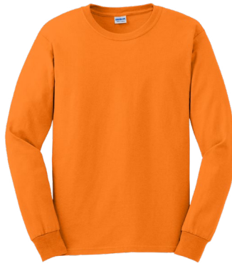
GILDAN® Ultra Cotton® 100% US Cotton Long Sleeve T-Shirt G2400 | Adult Sizes: S-4XL