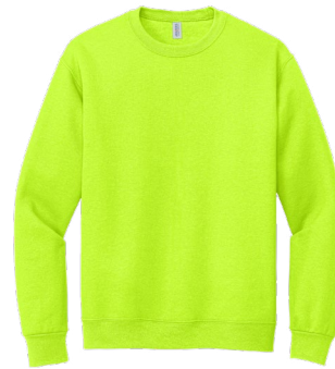
JERZEES® Super Sweats® NuBlend® Crewneck Sweatshirt 4662M | Adult Sizes: S-3XL