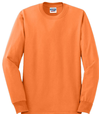
JERZEES® Dri-Power® 50/50 Cotton/Poly Long Sleeve T-Shirt 29LS | Adult Sizes: S-3XL