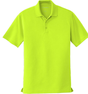
PORT AUTHORITY® Dry Zone® UV Micro-Mesh Polo KT10 | Adult Sizes: XS-6XL