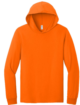
JERZEES CLASSICS™ Unisex Cotton Long Sleeve Hooded T-Shirt 363LH | Adult Sizes: S-3XL