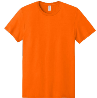
JERZEES CLASSICS™ Unisex Cotton T-Shirts 363M | 363Y | Adult Sizes: S-5XL | Youth Sizes: XS-XL