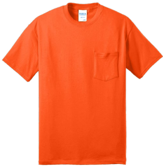
PORT & COMPANY® Core Blend Pocket Tees PC55P | PC55PT | Adult Sizes: S-6XL | Tall Sizes LT-4XL