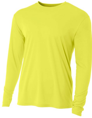
A4 Cooling Performance Long Sleeve Tee A4N3165 | Adult Sizes: XS-4XL