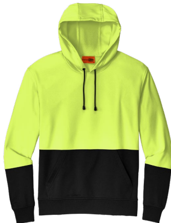
CORNERSTONE® Enhanced Visibility Fleece Pullover Hoodie CSF01 | Adult Sizes: XS-4XL