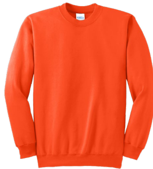
PORT & COMPANY® Essential Fleece Crewneck Sweatshirts PC90 | PC90T | Adult Sizes: S-4XL | Tall Sizes: LT-4XLT