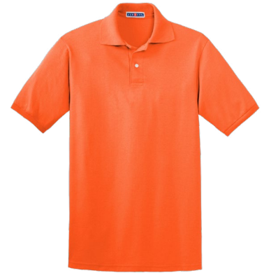
JERZEES® Dri-Power® Sport Shirt 437M | Adult Sizes: S-4XL