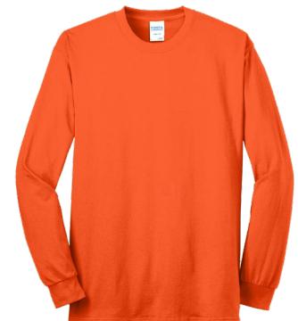
PORT & COMPANY® Long Sleeve Core Blend Tees PC55LS | PC55LST | Adult Sizes: S-6XL | Tall Sizes: LT-4XLT